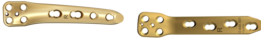
Figure 2 Both the anatomical MDF plate, left, and the antecedent MDF plate, right. The anatomical MDF plate has an optimized shape, to better fit the distal femur; it has improved screw-hole directions, and is shorter and slimmer, but equally thick.

Vantico GmbH, Wehr, Germany) in a specially constructed fixture; the fixture allowed for mounting of the femur in a materials testing machine (MTS) (Mini Bionix, MTS Systems Corporation, Eden Prairie, MN, USA) (Figure 3). The fixture was designed in such a way that the axis of loading of the replicate femur in the MTS was through the centre of the femur head proximal and through a point 18-mm medial from the mid-condylar distance, creating a mechanical femur axis of 2°; reproducing loading in the normally aligned human knee after a supra-condylar femur osteotomy (SCO) for valgus osteoarthritis.